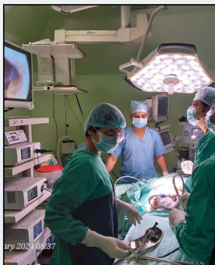
LAPROSCPIC SURGERY UNIT