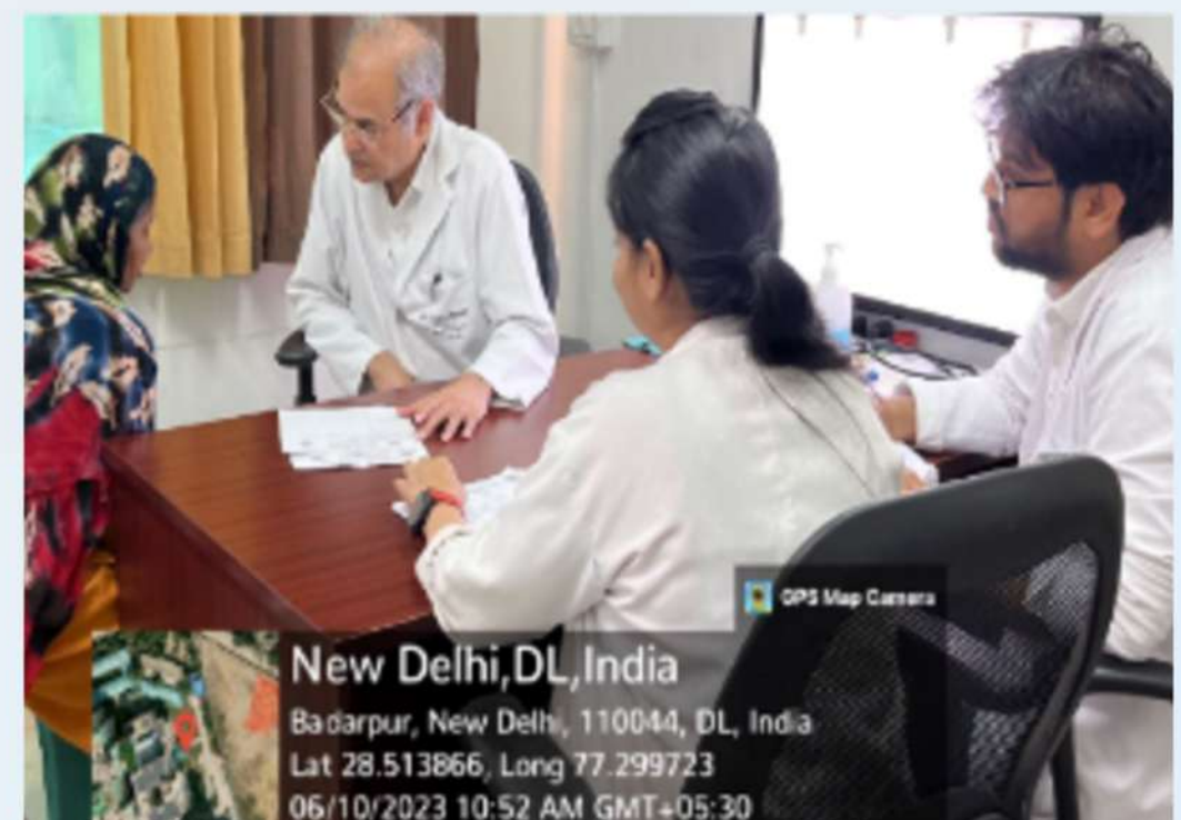
Asthi Sandhi Marma Roga OPD