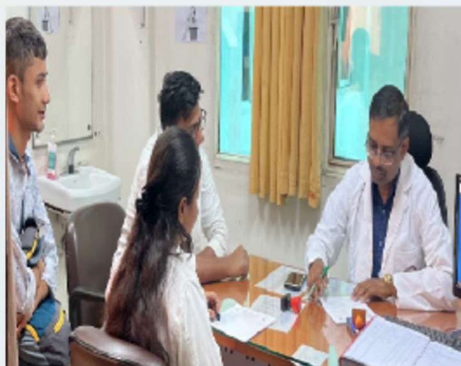
Guda Roga OPD