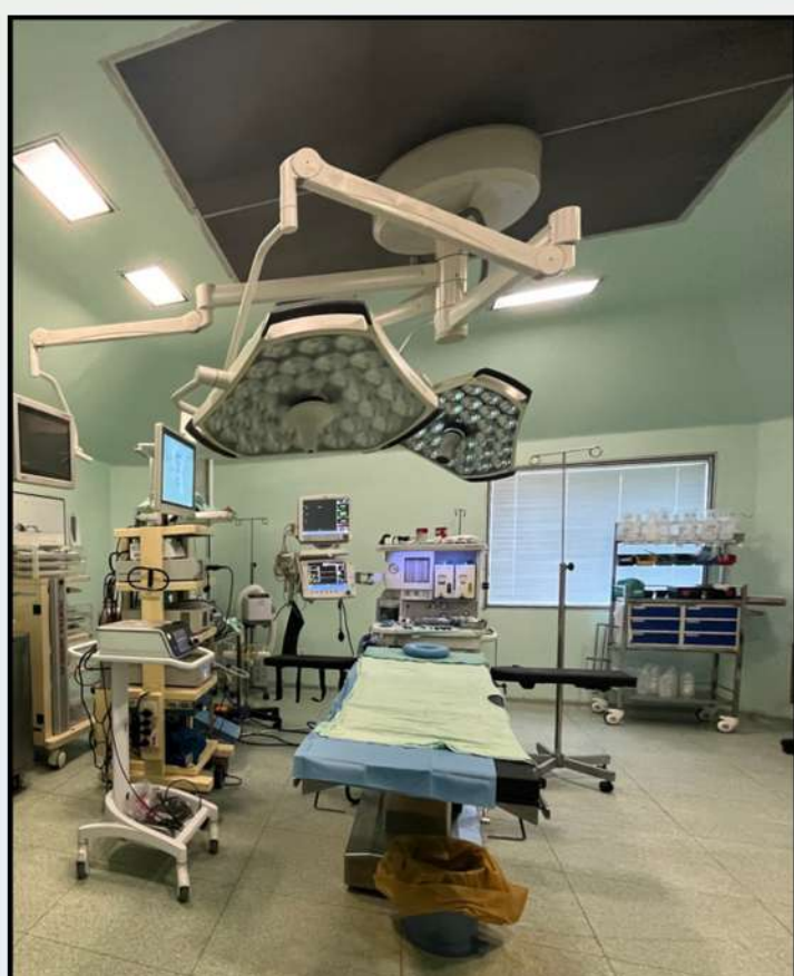
MODULAR OT COMPLEX

All India Institute of Ayurveda, New Delhi National Sushruta Association