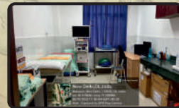
Gastro Colonoscopy Unit