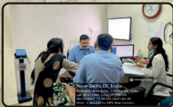
General Surgery OPD