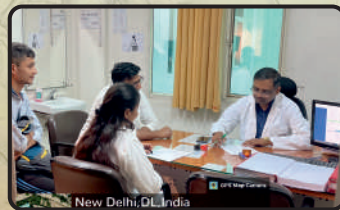
Ano Rectal OPD