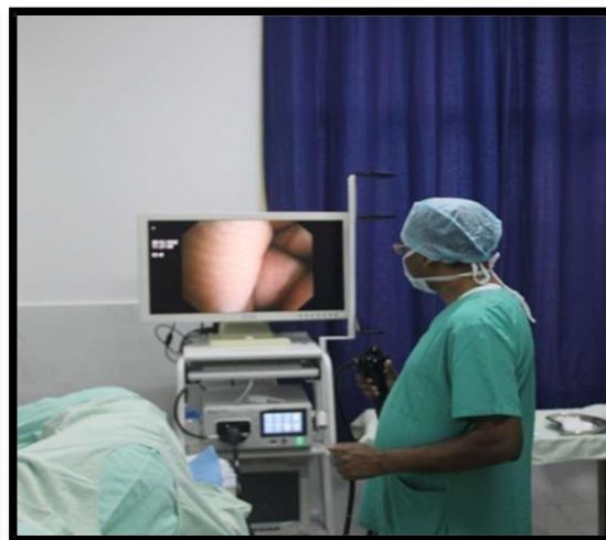
Video Gastro-Colonoscopy Unit

The Ksharakarma Unit is most admirable unit providing treatment to patients of Arsha (piles), Bhagandara (fistula-in-ano), Parikartika (fissure-in-ano), Nadivrana (sinuses) etc. More than 100 patients per day are visiting for Ksharakarma from Delhi and nearby states.