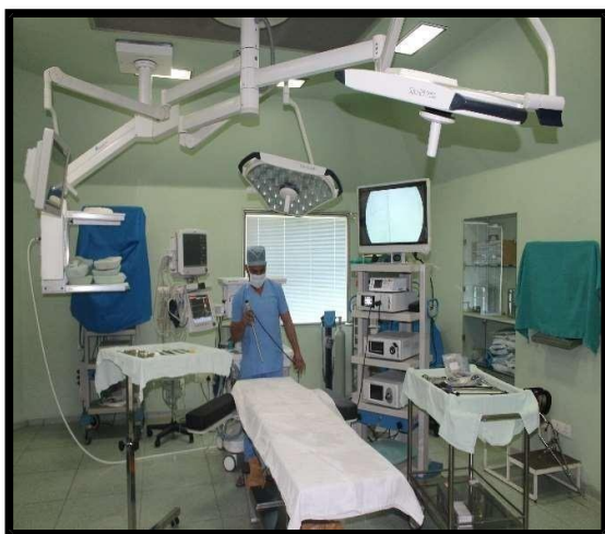
Modular Operation Theatre

At present the dept. is running three clinical specialty OPDs namely 1. Samaya Shalya OPD/ General Surgery 2. Guda Roga / Ano-Rectal OPD 3. Asthi-Sandhi-Marma Roga / Integrated Orthopaedic and Sports Injury OPD. The Mootraroga / Ayurveda Urology unit is also being developed. The department is well equipped with modular operation theatres and all the advanced gadgetry including laparoscope, colonoscope, gastroscope and bronchoscope. The simulation lab is in an advanced state of setting up.