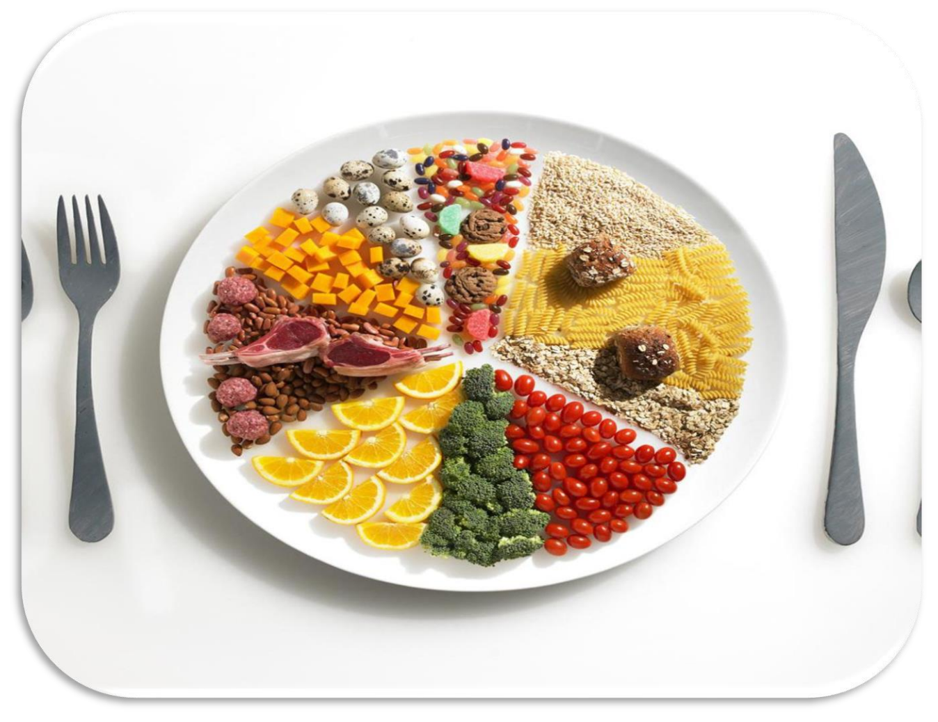
Last Date of Application: 30th November 2023