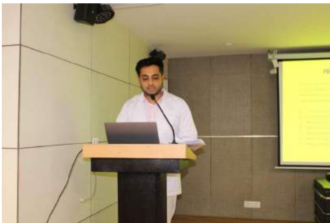
Presentation of thesis research work by the scholars