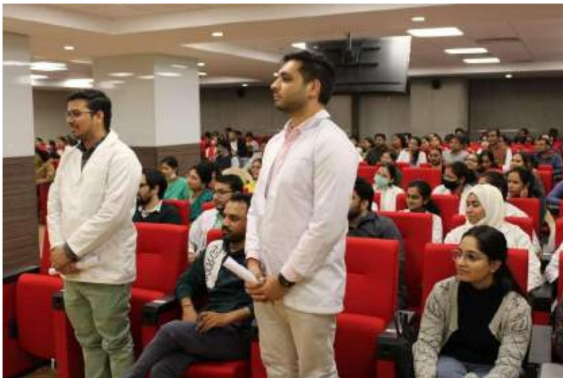
Discussion on the research studies