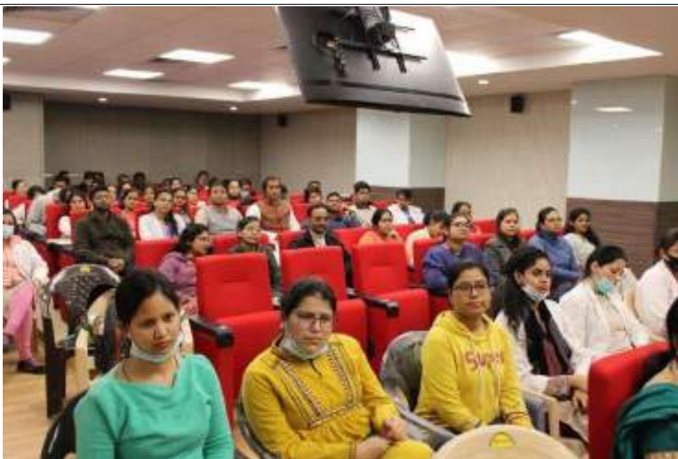
Inter departmental seminar