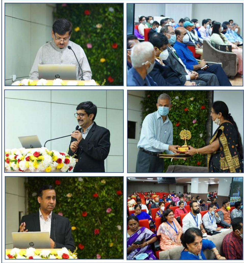
Snapshots from the seminar

Over 150 delegates participated in the seminar and delegated from about 400 AYUSH institutes and MoU partners working in collaboration with AIIA witnessed the seminar through online mode. The basic objective of this event was to sensitize different AYUSH think tanks about the proposed start-up, develop entrepreneurs in the field of Ayurveda for Poshana and lead to novel marketing dimensions and contribute in the dream of Atma Nirbhar Bharat.