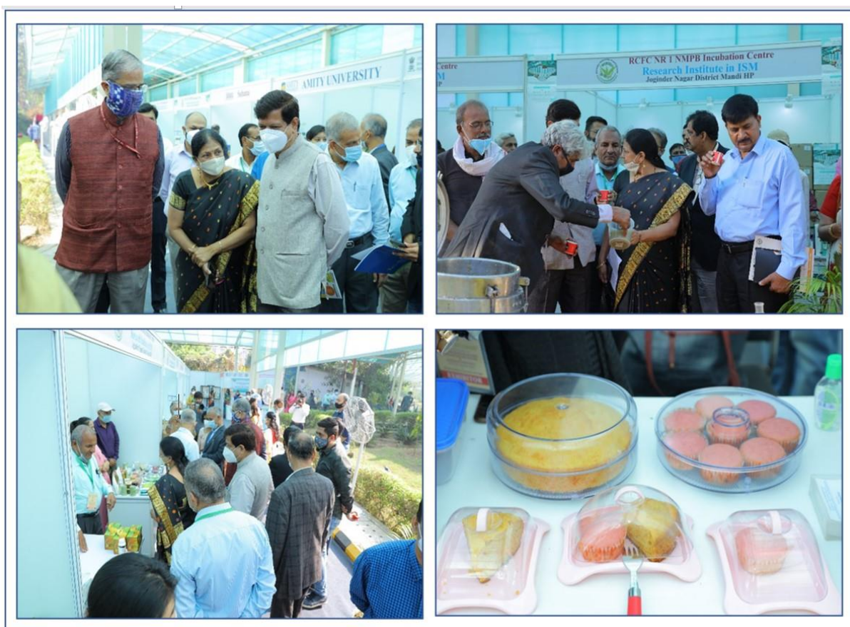
Dignitaries visiting the food expo stalls

AYURVEDA FOOD EXPO was the major attraction of the event to exhibit strength of Ayurveda in Food Sector through showcasing various Innovative recipes like Ready-to-eat healthy foods and others. It served as an ideal platform to bring together various stake holders of Ayurveda under one roof.