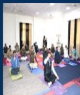
Police personnel – Stress management

347 under AYUSH Sector Haryana State Basic training program & training material