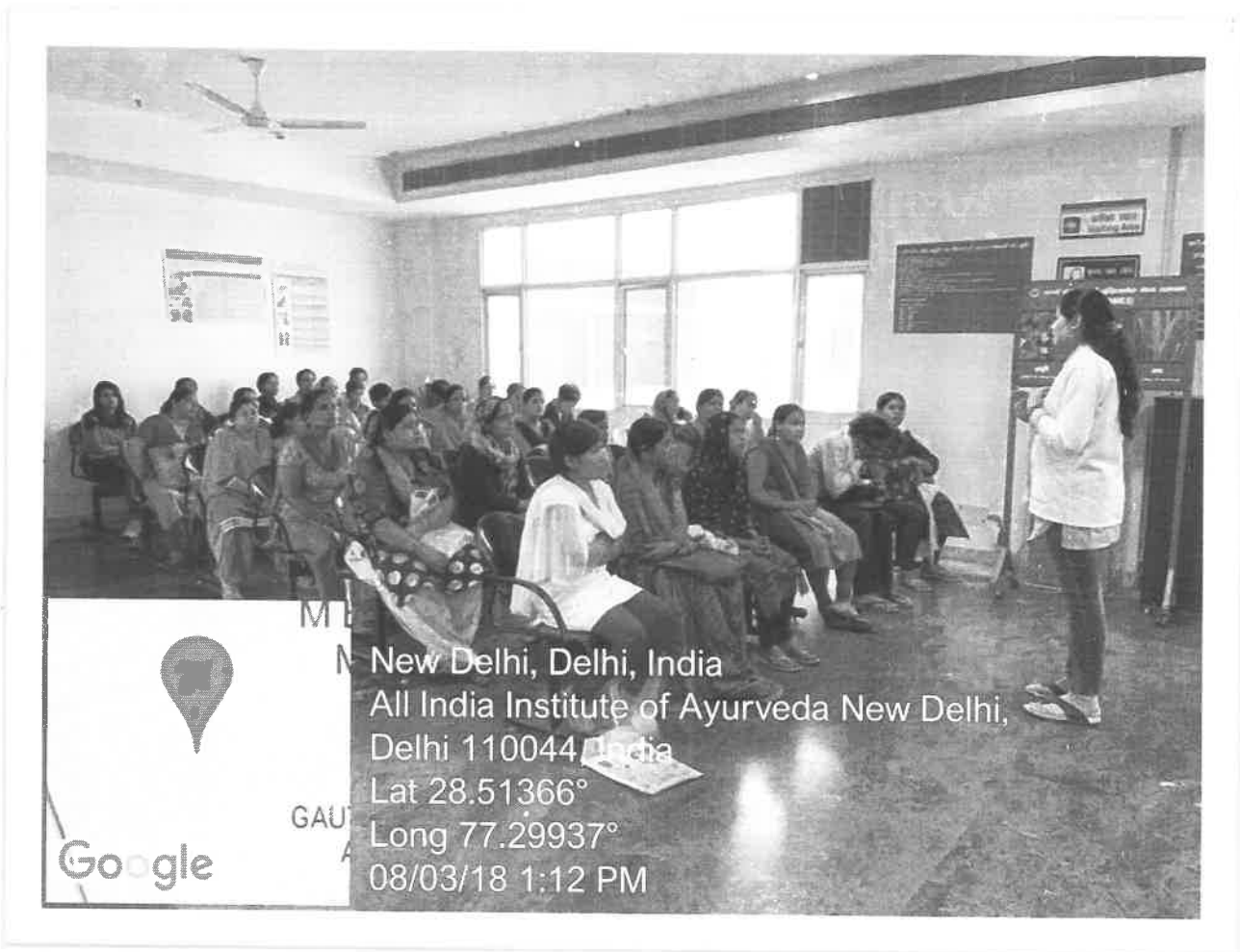
Patient Awareness Program -Womens Day Celebration 2018