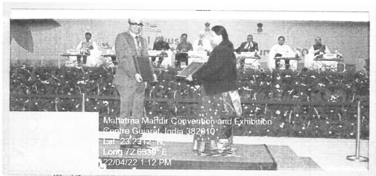
Toronto-based University Health Network (UHN) and the All-India Institute of Ayurveda (AIIA), New Delhi, signed a MoU