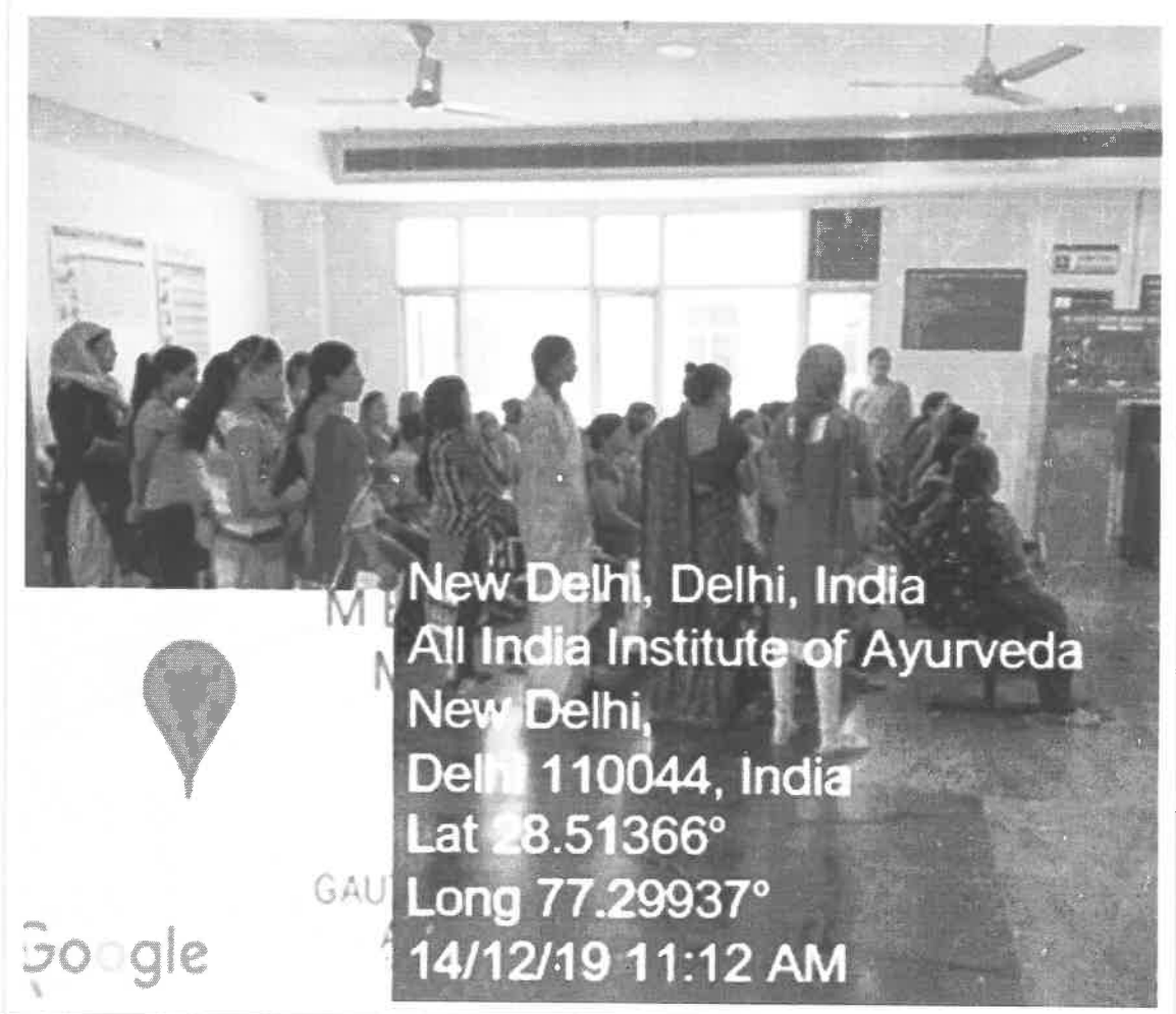
Awareness program on Womens Hygiene-2019