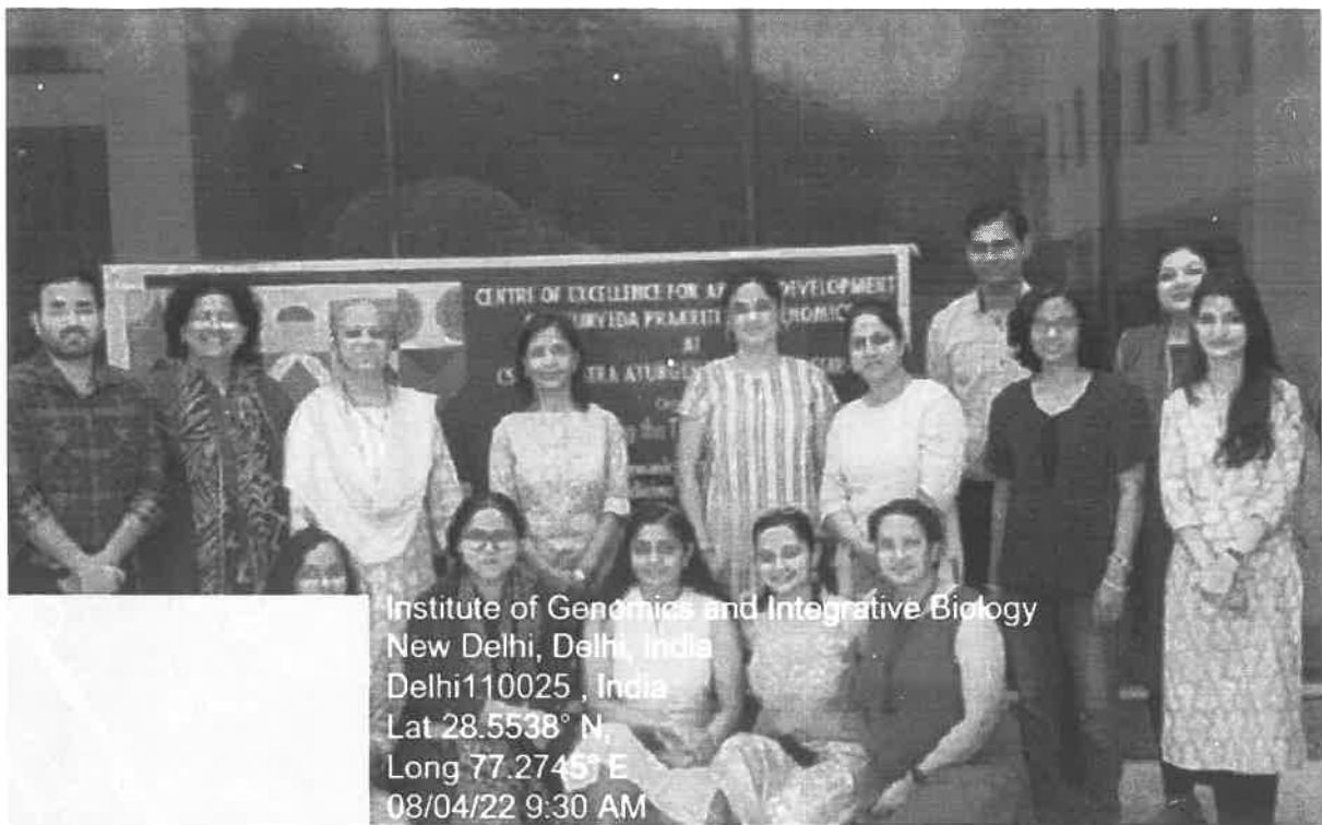
Scholars of AIIA IN CSIR-IGIB