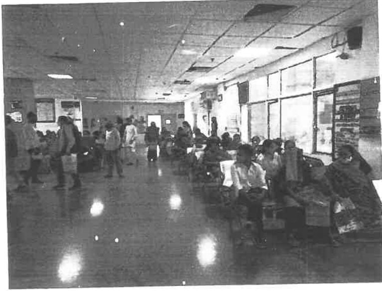
(Patients listening to the Awareness lecture)