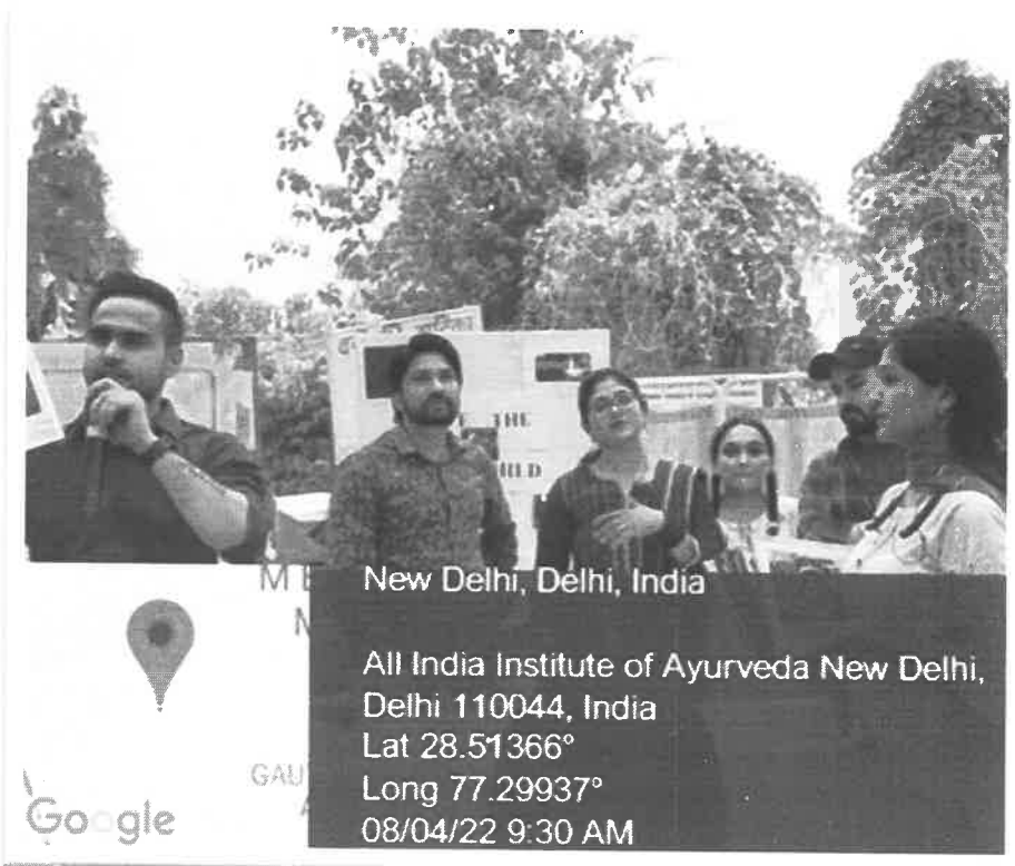
Awareness on Post COVID Complications -2022