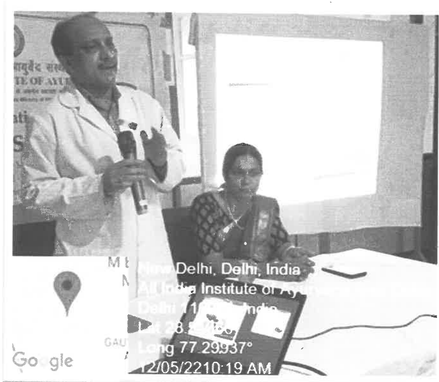
Patient Awarenesss Activity on Nurses Day -2022