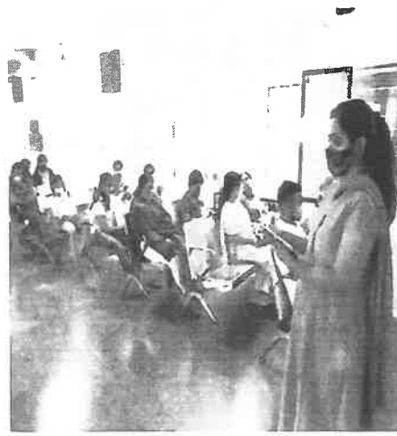
(M.D Scholars delivering a lecture at OPD)

गौतमपुरी, सरिता विहार, मथुरा रोड, नई दिल्ली -110076