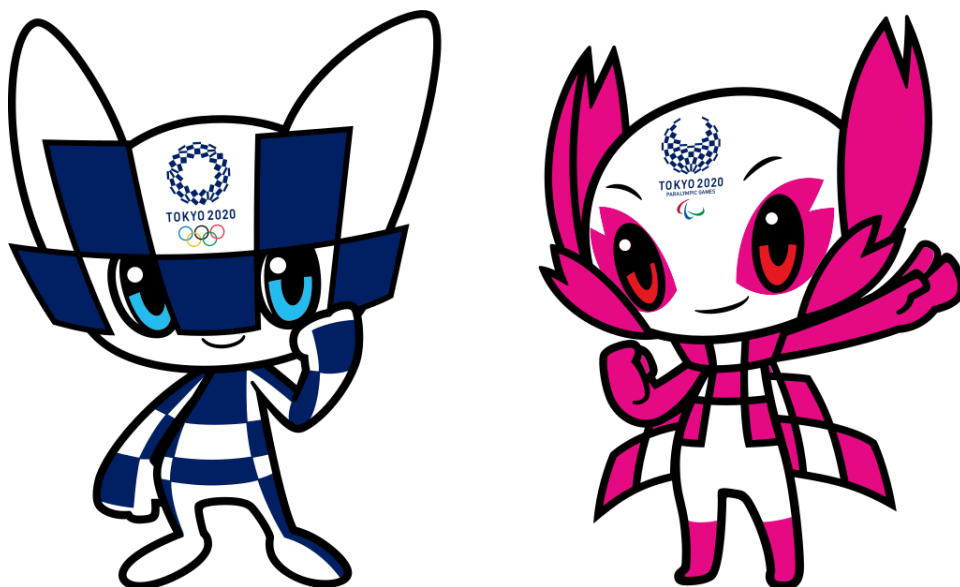
Miraitowa (left), the official mascot of the 2020 Summer Olympics, and Someity (right), the official mascot of the 2020 Summer Paralympics