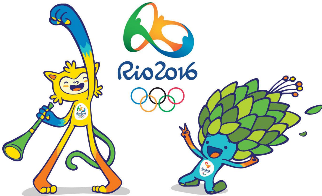
Vinicius (left), the mascot of the 2016 Summer Olympics, and Tom (right), the mascot of the 2016 Summer Paralympics